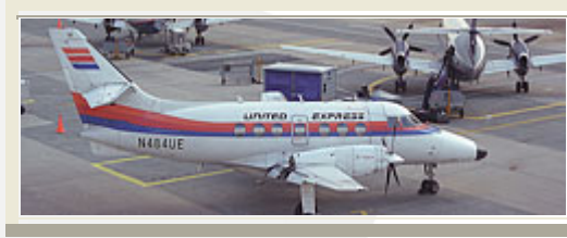
1990 JETSTREAM 32 Serial Number: 899